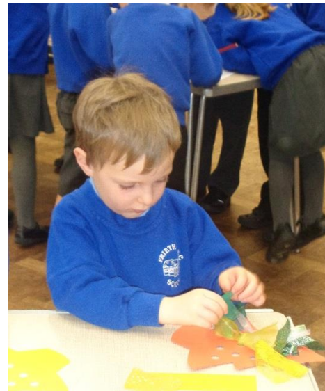
Christmas Craft workshops