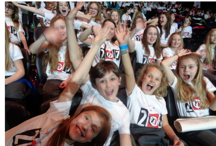
Young Voices 2017 Birmingham Arena